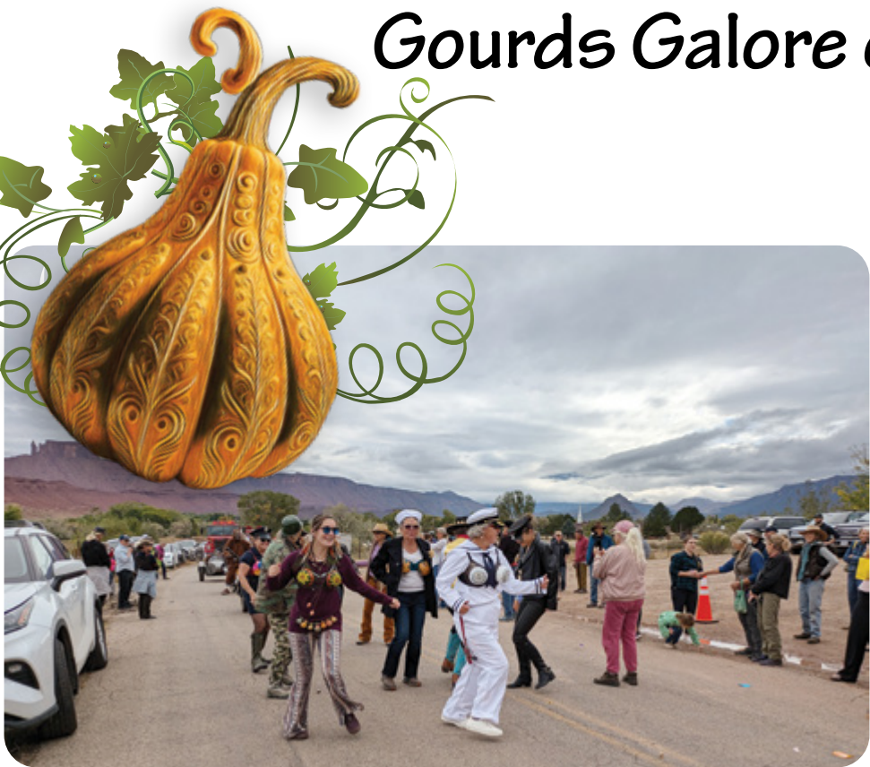
Gourdy Girls from Colorado on parade

It's back! The Castle Valley Gourd Festival is back with "more than gourds" again this year. As always, this fun day in the sun is free of charge. Donations are welcome and go to the Castle Valley Volunteer Fire Department.